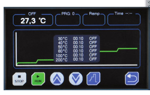
Temperature steps graphic.

Model Digitronic with solid metal door. Part No. 2005163 and 2005167. (With toughened glass window door. Part No. 2005164 and 2005168).